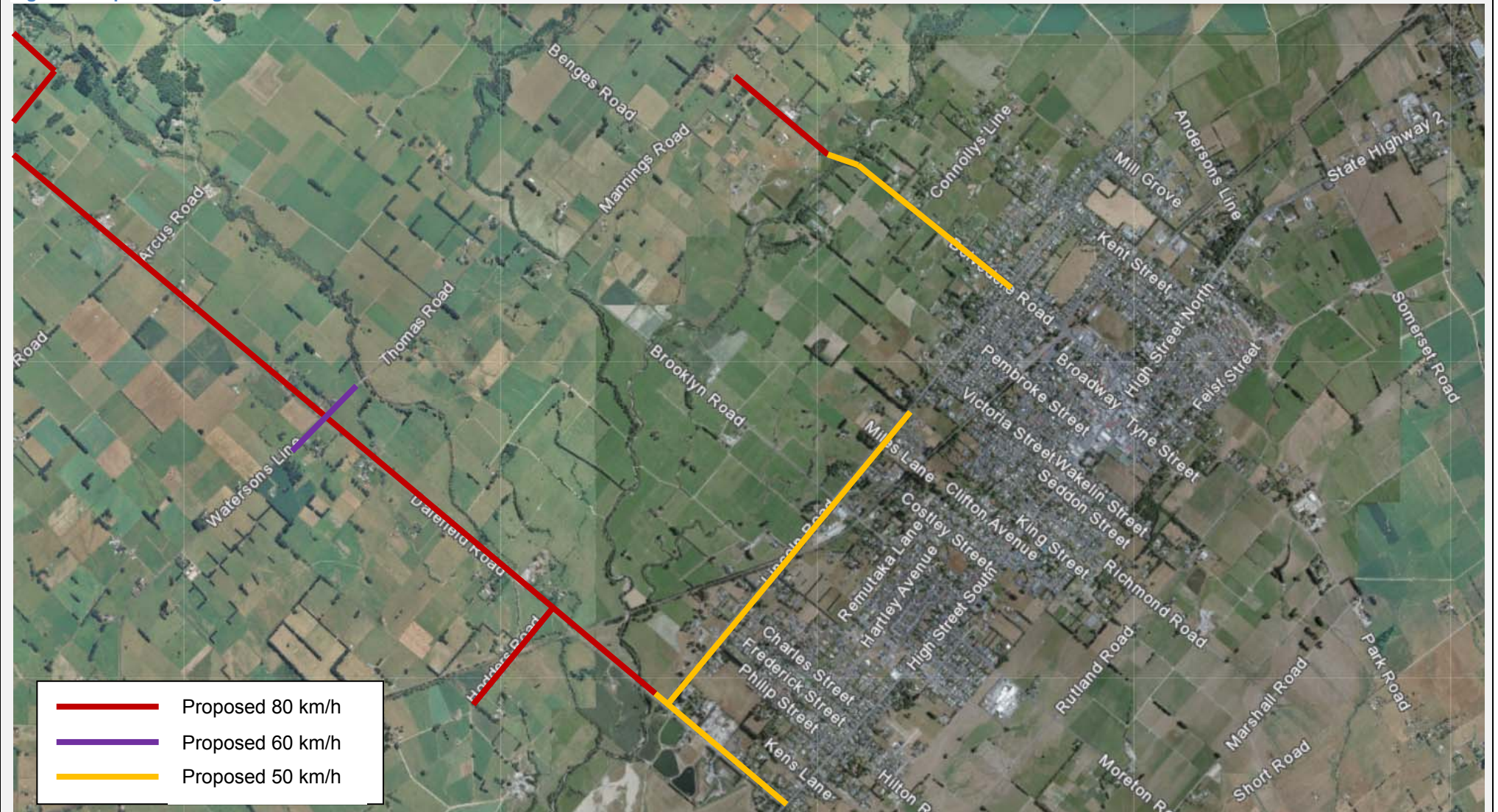
Figure 1 Proposed changes northwest of SH2 Carterton