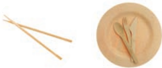
Soft/thin bamboo materials & cutlery