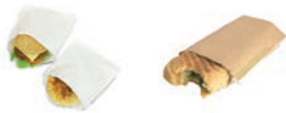
Vegetable wax coated paper

This is the only greaseproof paper which can be composted