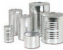
Tins & cans

Contact your local council for more information about which types can be accepted