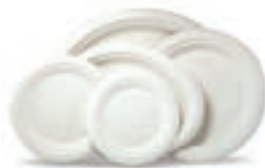
Sugarcane or Bagasse