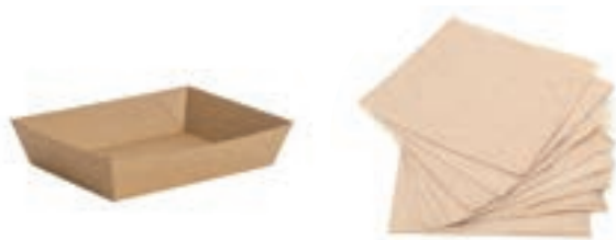
Unlined paper & cardboard

Materials accepted into the commercial compost include certified food packaging products made from: