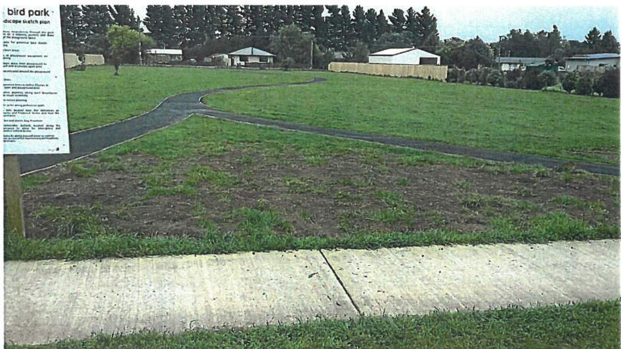
View of path taken from Charles Street

A meeting was held at the park on 12th April with a few of the immediate neighbours, Councillor O'Callaghan and the Parks and Reserves Manager to discuss what trees would be planted around the perimeter of the park and to talk about the type of lighting. It was agreed to plant native trees around the perimeter. Everyone was happy with the use of solar lights identical to the light installed in Pembroke St. and Victoria St. Reserve. The residents were pleased with the layout of the path (shown below) and are looking forward to further progress.