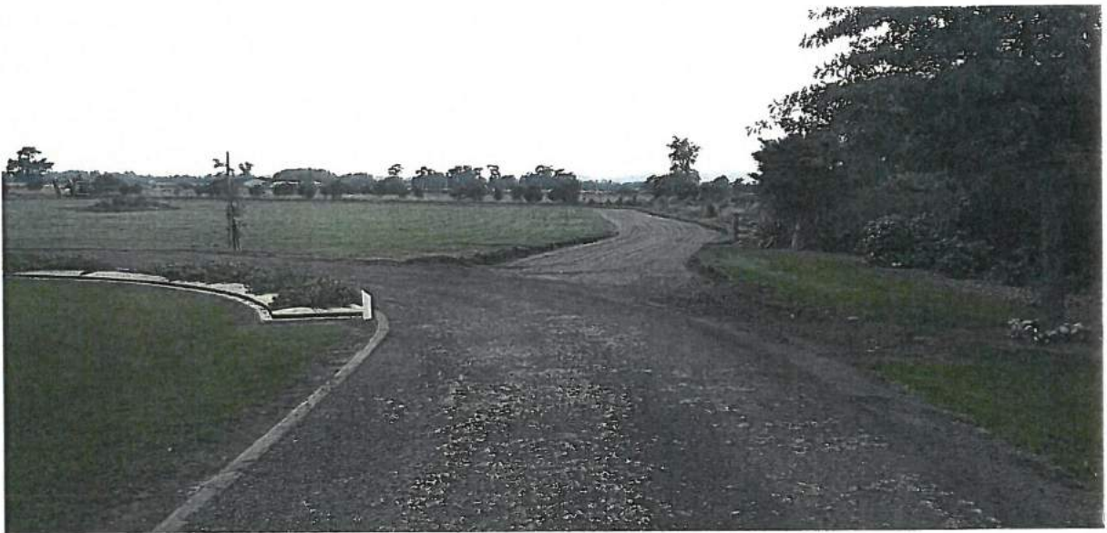
Southern side excavation and base course