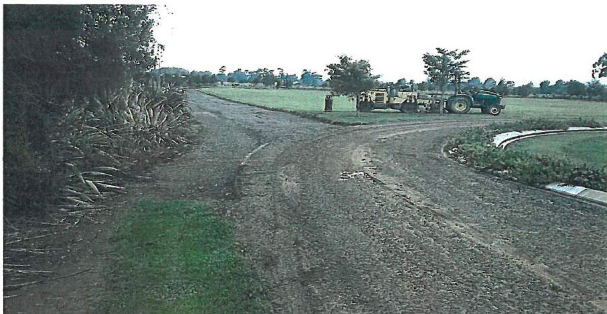
Northern side excavation and base course