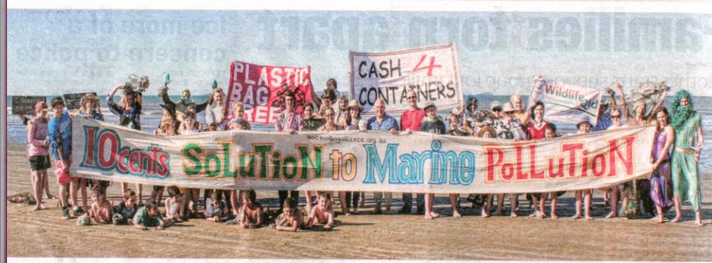
10 MORE PLASTIC: A Cash for Containers publicity event was held at Yeppoon's Main Beach on Sunday, aiming to ban the use of plastic bags and containers.