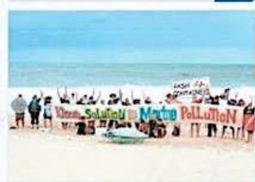
CAMPING: Demonstrators at last Sunday's cash for containers rally.