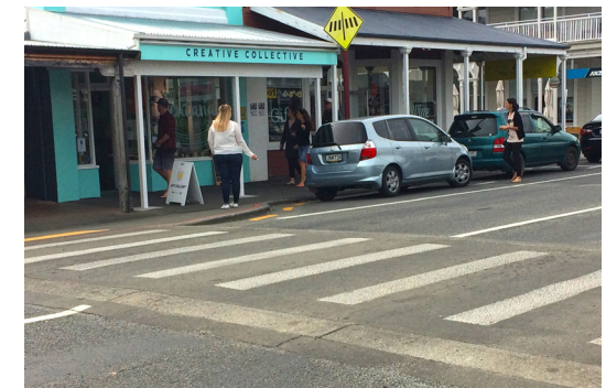
An example of a raised pedestrian crossing in Martinborough

Work will start by the end of June and is expected to take about two weeks to complete, subject to weather. Motorists are advised to expect short delays during the work. The main physical works to construct the new raised road surface across the highway will take approximately three days. The rest of the work to install new lighting, road markings and signage will have less impact on traffic flows.